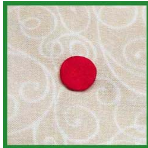
Front of work showing berry pinned in place.

Using your favorite applique thread, stitch the berry into place with lots of tiny stitches.